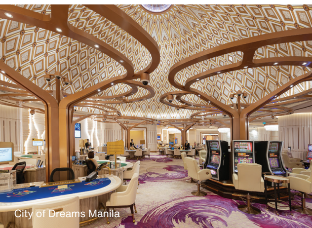
City of Dreams Manila